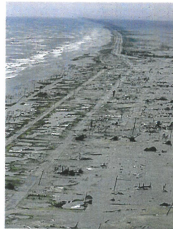
Right: Holly Beach, LA after Hurricane Rita.