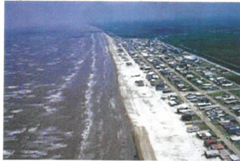
Above: Holly Beach, LA before Hurricane Rita.

Visit this website www.lawarn.org on how to join LaWARN.