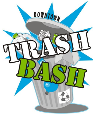
Community Clean Up Day.