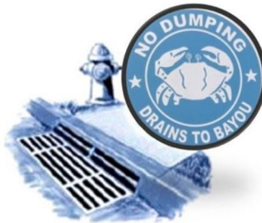
Storm Drain Markers